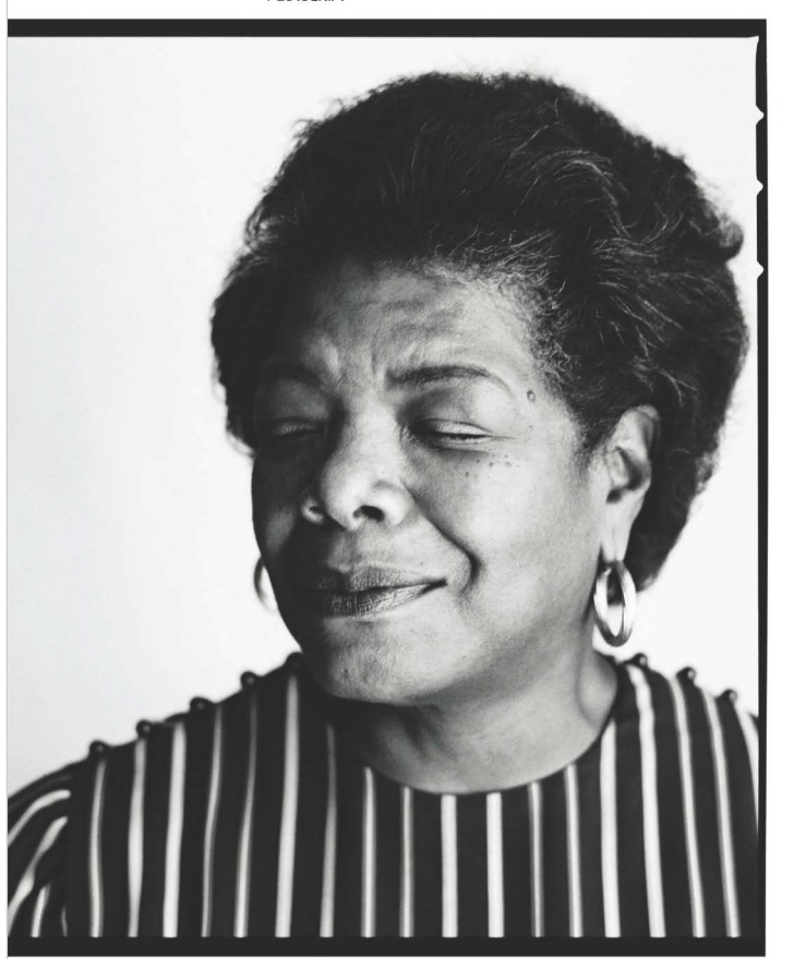
memoirist, calypso singer, actress, civil-rights activist, and teacher, photographed at the Algonquin Hotel, in 1987.